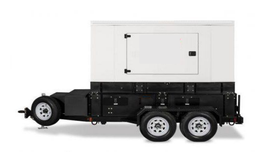
200kW Mobile Generator $POA