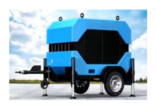
50kW Silent Magnetic Generator