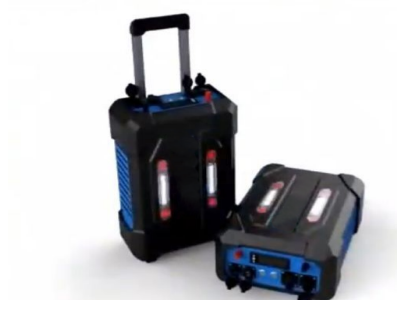
2kW Silent Magnetic Generator

These generators have single/three phase at 50/60-Hertz