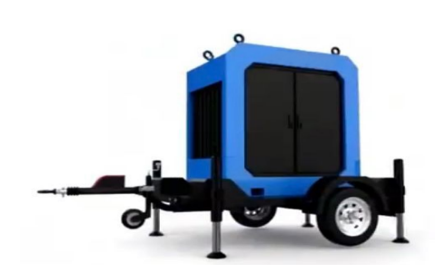
20kW Silent Magnetic Generator