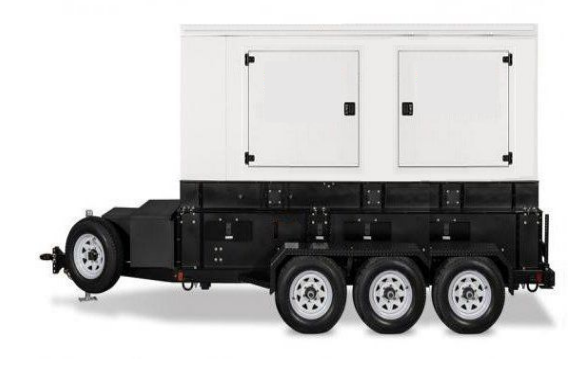
250kW Mobile Generator $POA