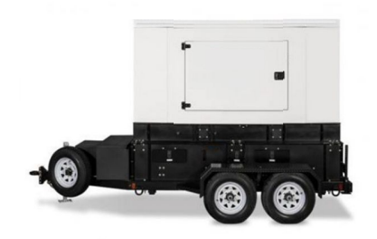
100kW Mobile Generator $POA