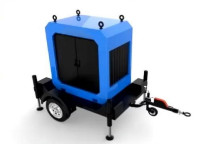
10kW Silent Magnetic Generator